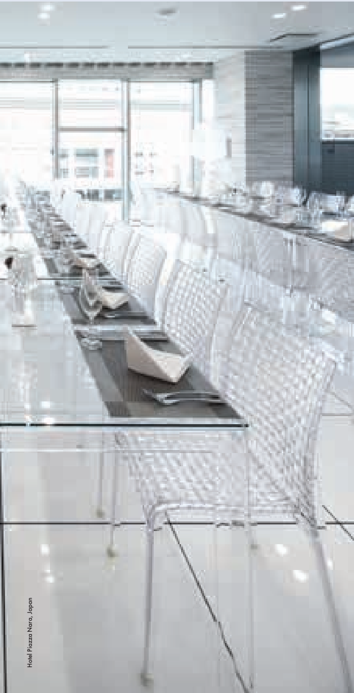
Hotel Piazza Nara, Japan